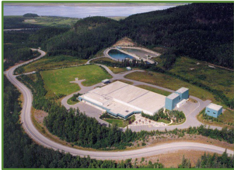
Eklutna Water Treatment Facility

AWWU is committed to delivering the highest quality water through source water protection, excellent operations, state-of-the-art treatment and continuous monitoring. This report summarizes information from